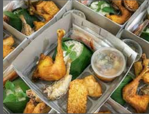
Lunch Box Rp 35.000/pax