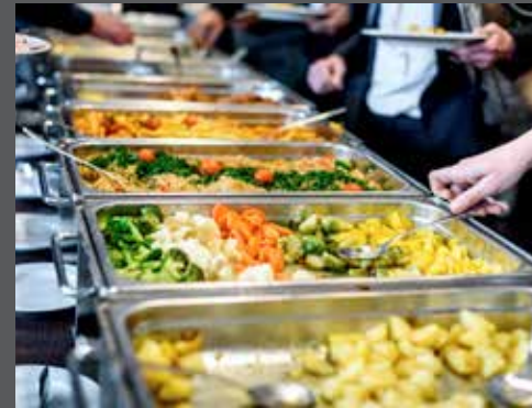
Buffet/Prasmanan Rp 75.000/pax

*Ask our staff for our menu package lists