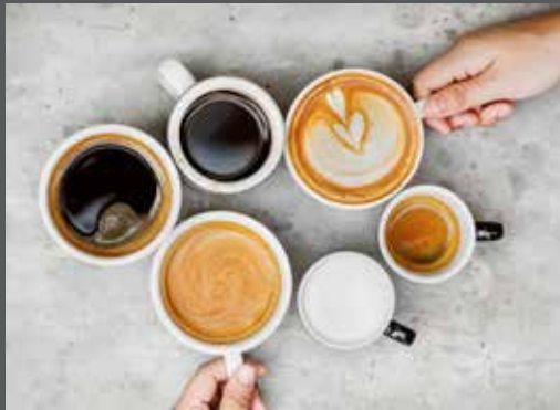
Coffee Break Rp 35.000/pax